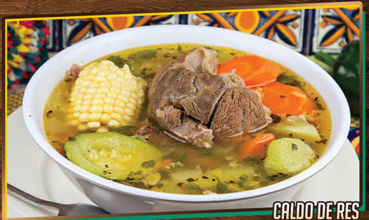
CALDO DE RES