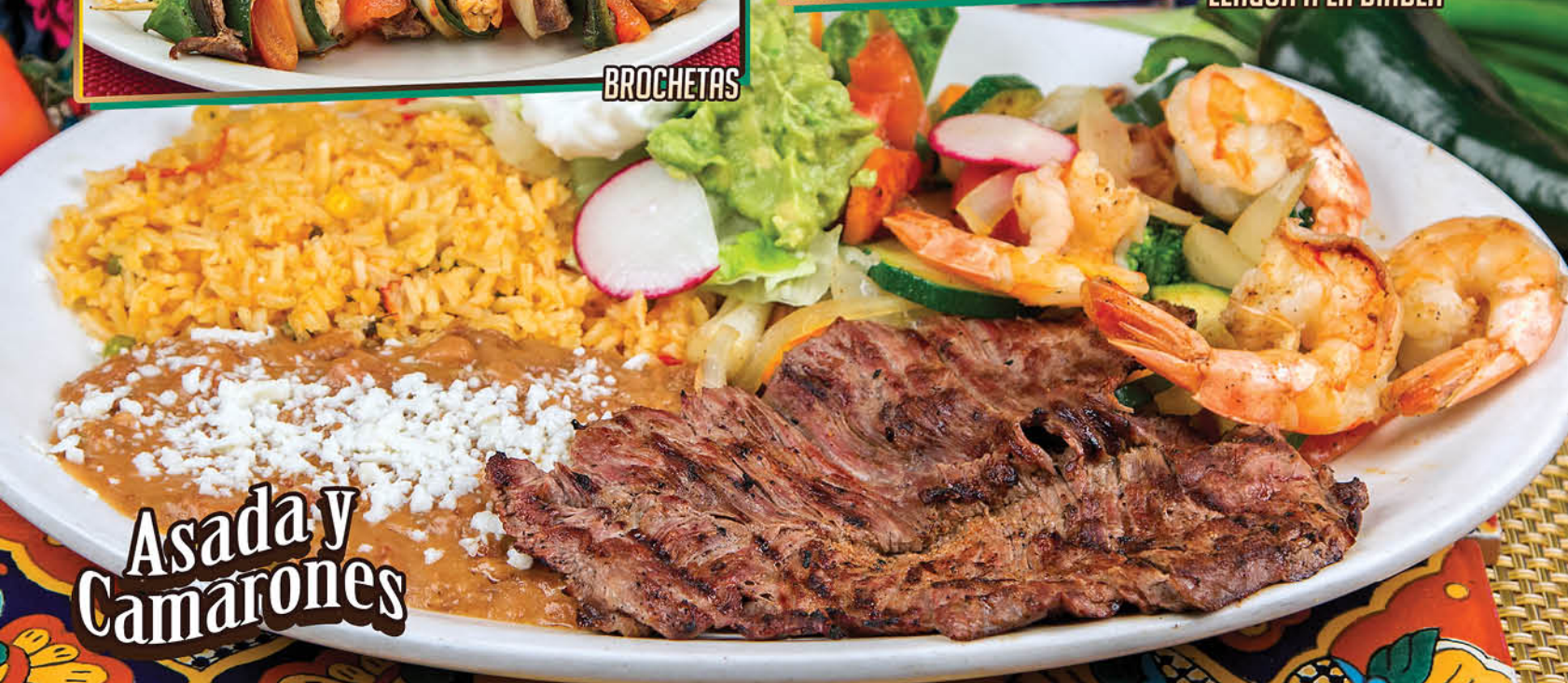
Asada y Camarones