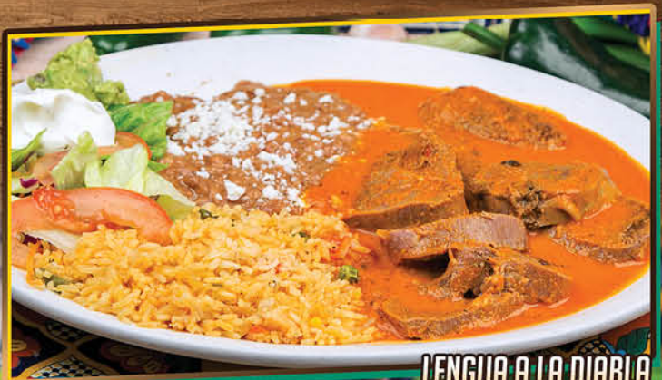
LENGUA A LA DIABLA