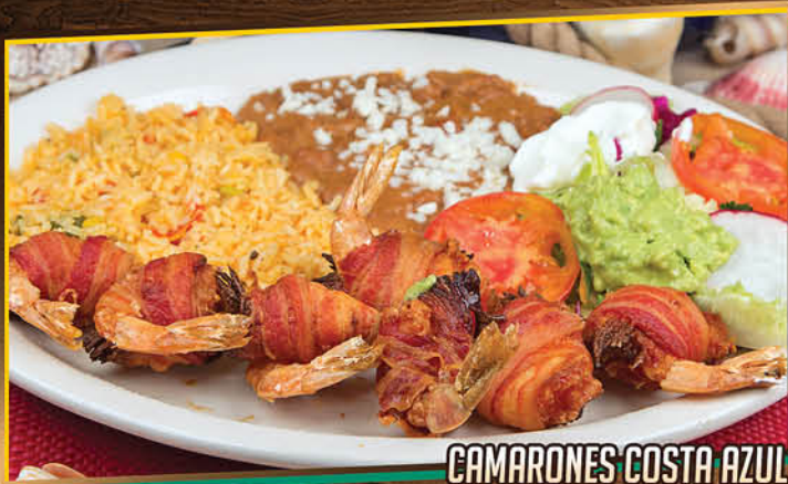
CAMARONES COSTA AZUL