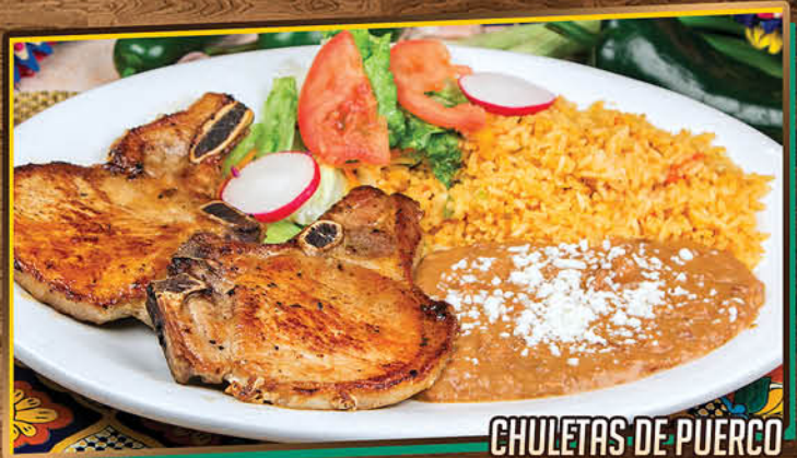
CHULETAS DE PUERCO