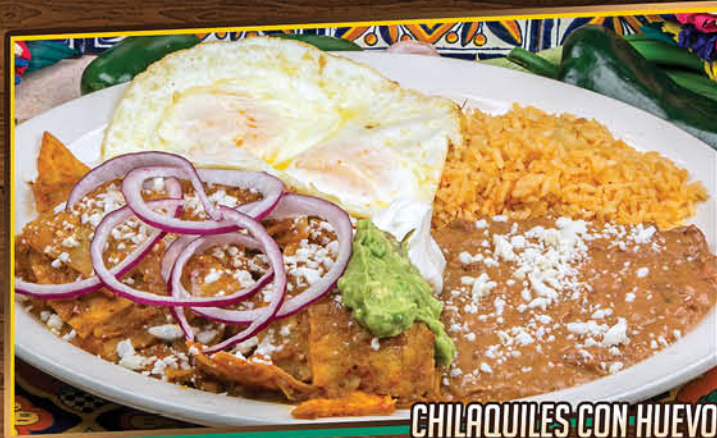
CHILAQUILES CON HUEVO