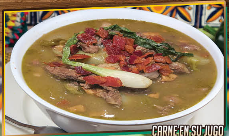
CARNE EN SU JUGO