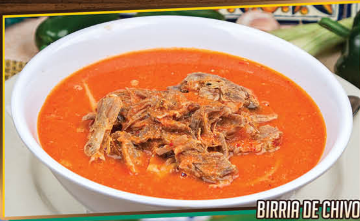
BIRRIA DE CHIVO