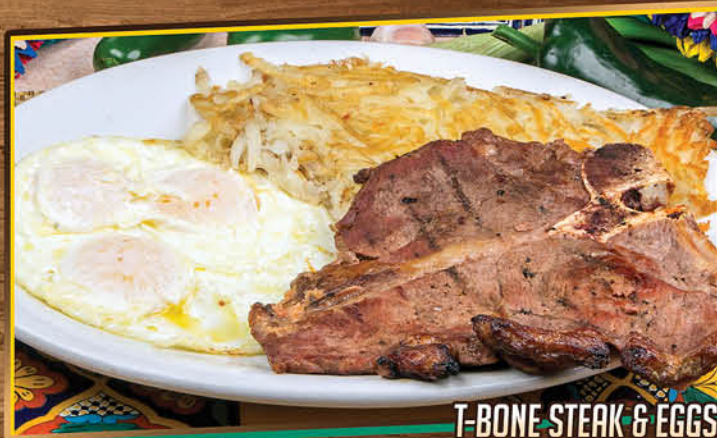
T-BONE STEAK & EGGS