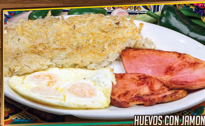
HUEVOS CON JAMON