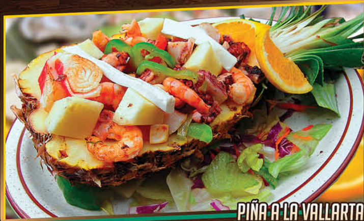
PIÑA A LA VALLARTA

WARNING: Eating raw Oysters and seafood may cause severe illness and even death in Persons who have liver disease (e.G. Alcohol Cirrhosis, cancer or others chronic illness that weakens the immune system. If you eat Oysters and become ill you should seek immediate medical attention. If you are unsure if you are at risk, you should consult your physician.