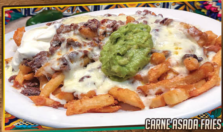
CARNE ASADA FRIES