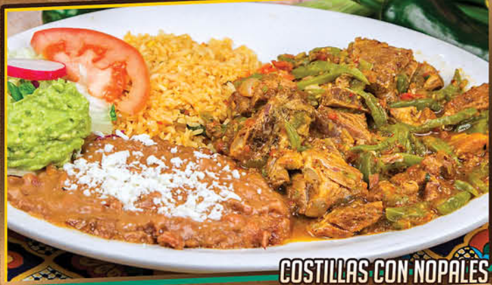
COSTILLAS CON NOPALES